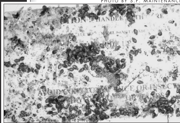
Bedbugs proliferate in warm weather. They spiked during record heat in March.