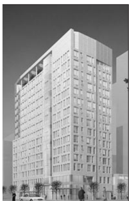
Skidmore, Owings & Merrill rendering of the proposed senior housing building, one of three 10th and Market development structures