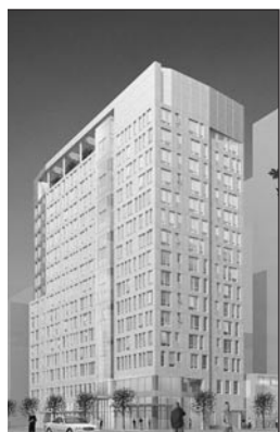
Skidmore, Owings & Merrill rendering of the proposed senior housing building, one of three 10th and Market development structures

The huge development, said presenter Valerie O'Donnell, TNDC construction project manager, will include a 15-story, 158-unit Mission Street tower with low-income housing for seniors only; a building mid-block on 10th Street that will rise 21 stories and provide up to 240 units of low- and moderate-income family housing; and, on Market Street, a 24-story building with 440,000 square feet of city offices. Combined, the three buildings will have 13,000 square feet of commercial space.